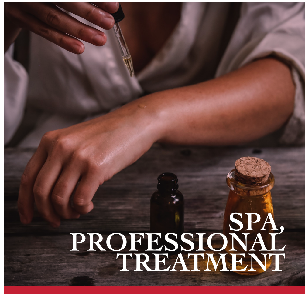
SPA, PROFESSIONAL TREATMENT