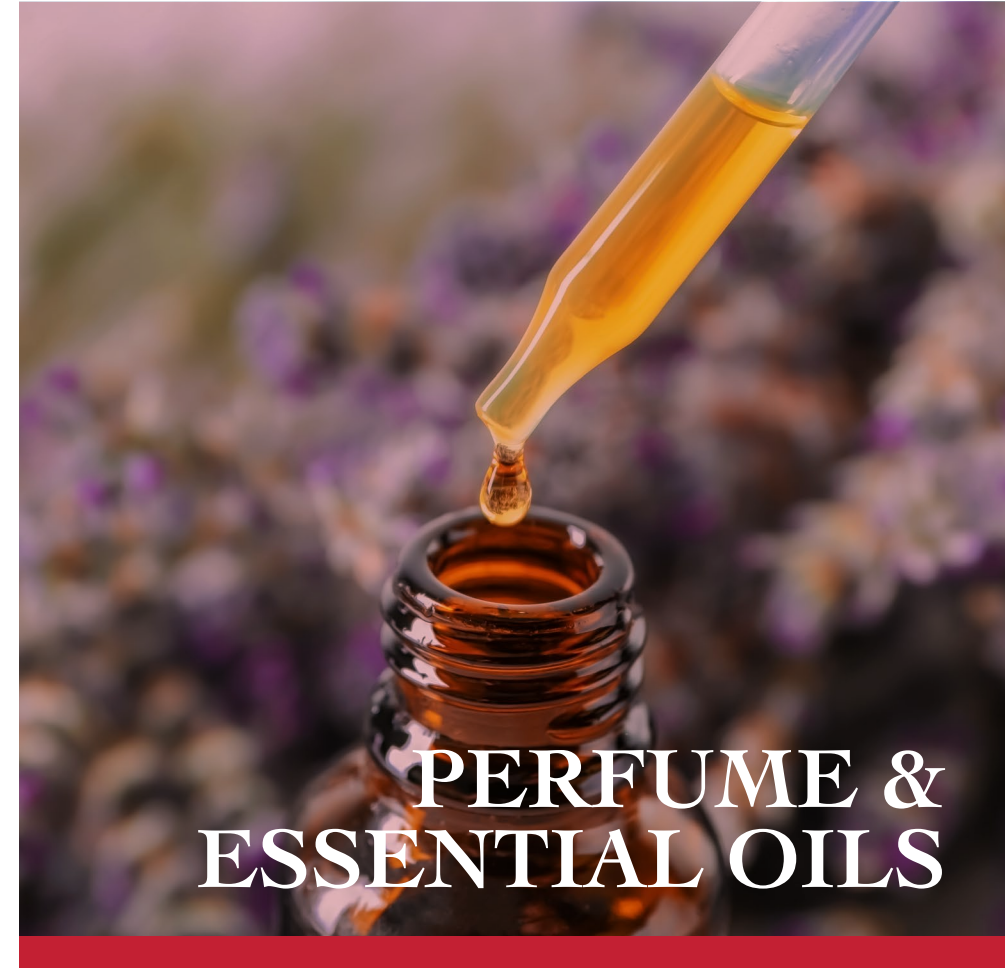
PERFUME & ESSENTIAL OILS