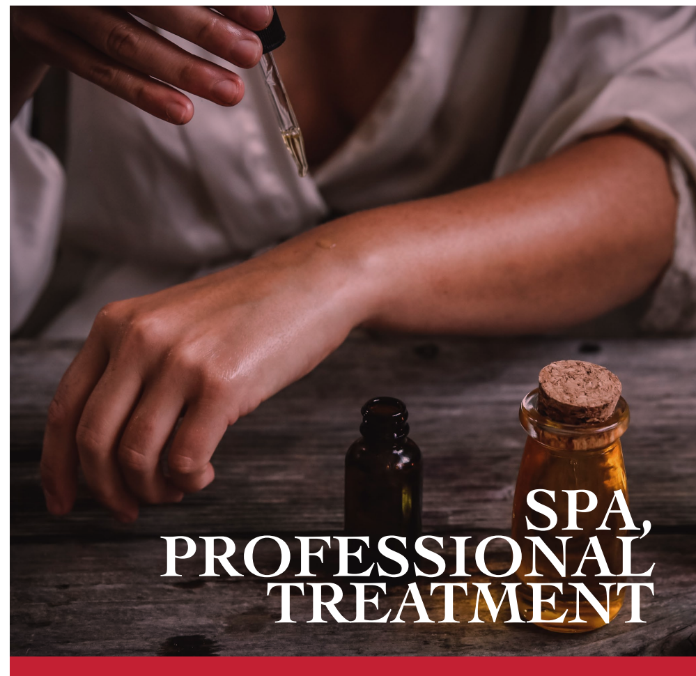
SPA, PROFESSIONAL TREATMENT