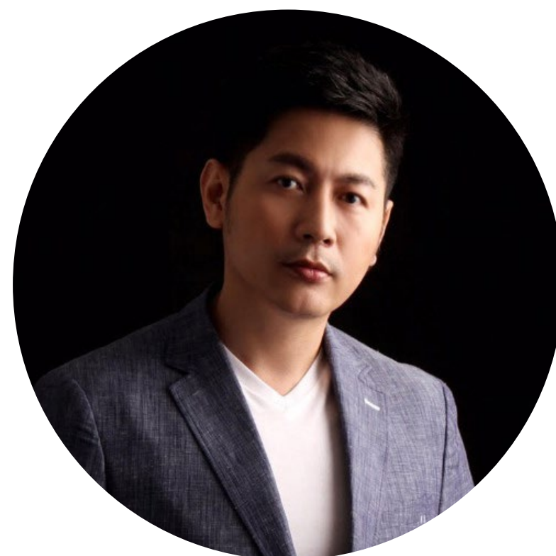
TOMS WU CO-FOUNDERS

LEAD IN STRATEGY & COMMUNICATION FORESEE | FORECAST | FACILITATE